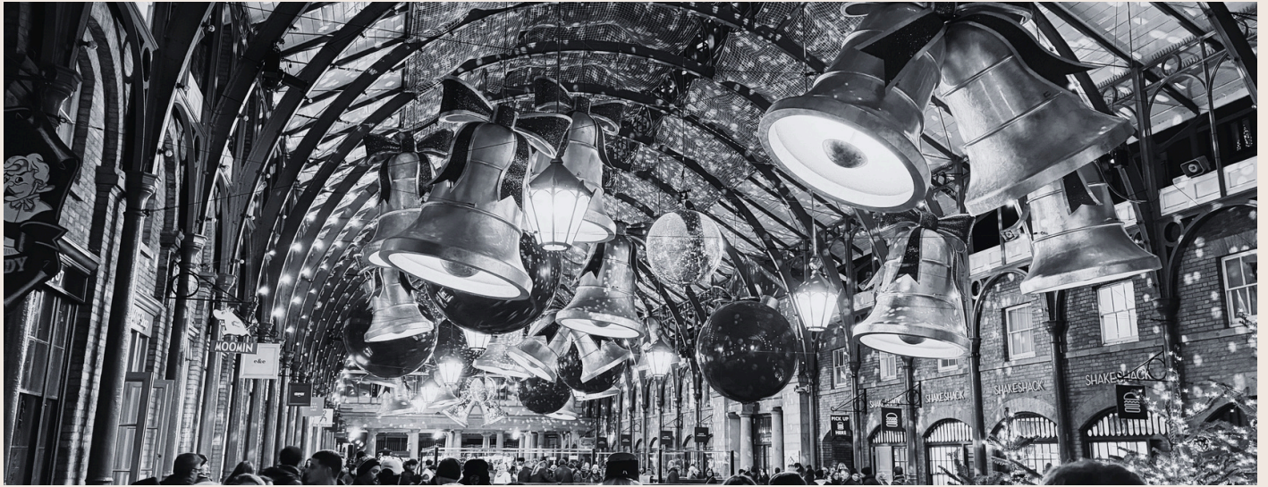
COVENT GARDENS CHRISTMAS BELLS