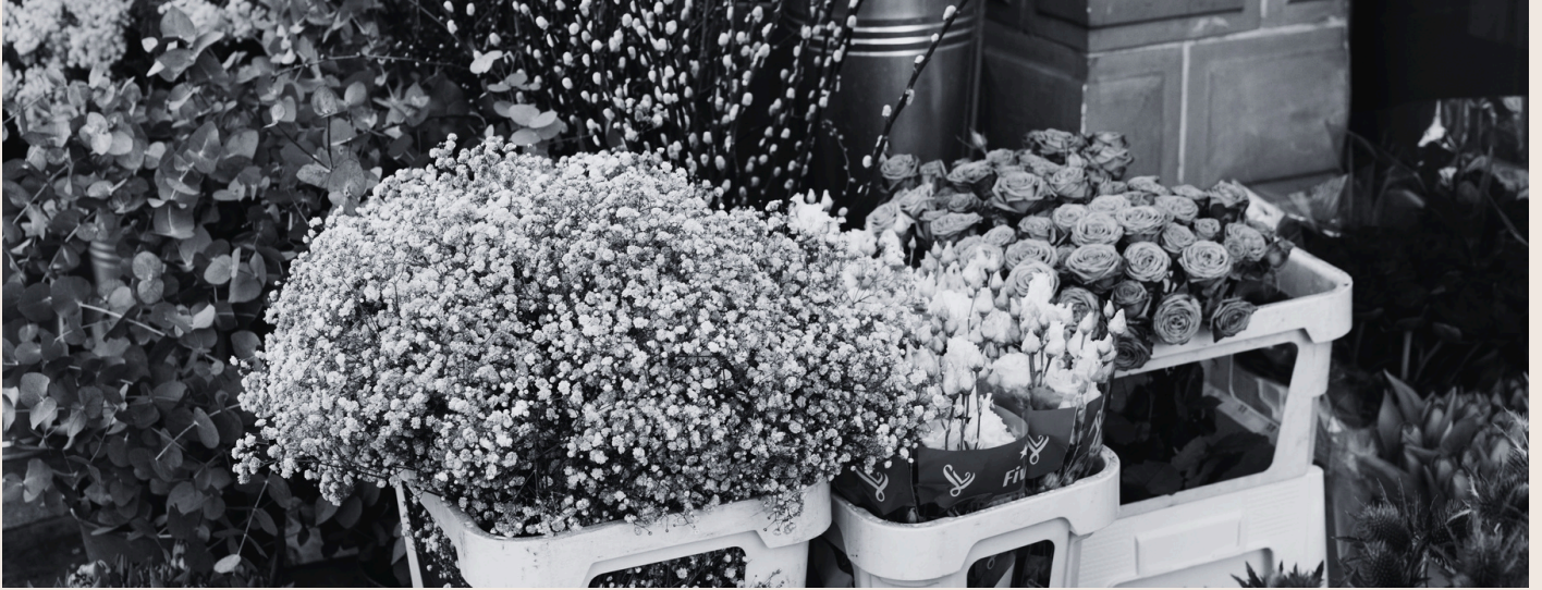
CHELSEA FLOWER SHOW